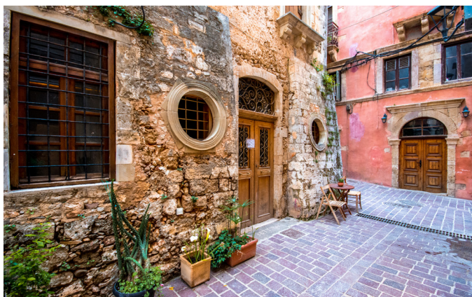
Streets of Chania Old Town