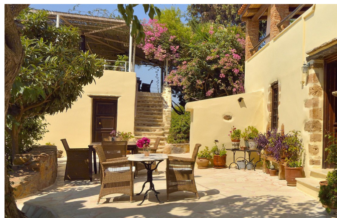
Elia Traditional Hotel Workshop venue

Note: The itinerary and accommodation described in this detailed itinerary are subject to change due to logistical arrangements and to take advantage of local events.