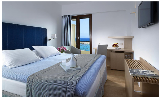
Room at Porto Veneziano Hotel